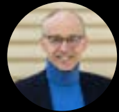
Luc Frieden Prime Minister