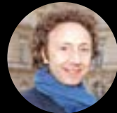
Stephane Bern Radio and TV animator