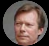
Henri Grand Duke of Luxembourg